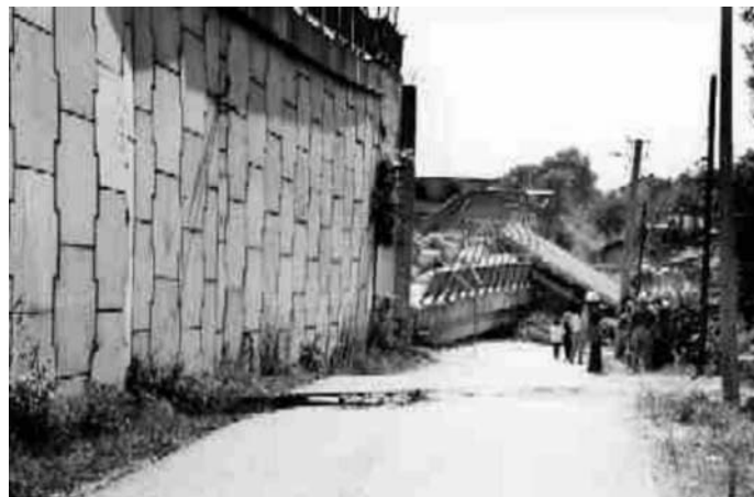
Figure 2. Arifiye Reinforced Earth ramp wall.

A full evaluation of the Reinforced Earth structures for this particular earthquake area has not yet been completed. However, one bridge and ramp structure was surveyed at Arifiye, almost immediately adjacent to the epicenter (Segrestin 2000 and Asheim