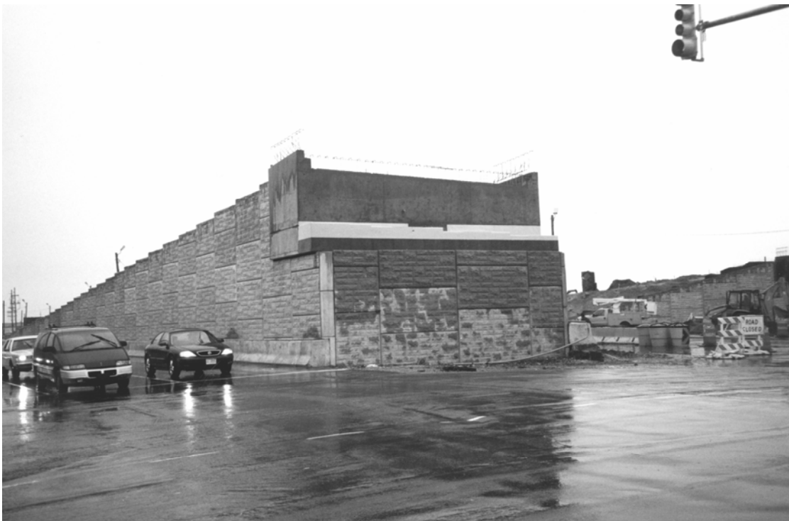
Figure 5. Complete two-stage structure, Atlantic City.

Abraham, A and Sankey, J, 1999. Design and Construction of Reinforced Earth Walls on Marginal Lands. Geotechnics of High Water Content Materials, ASTM STP 1374.