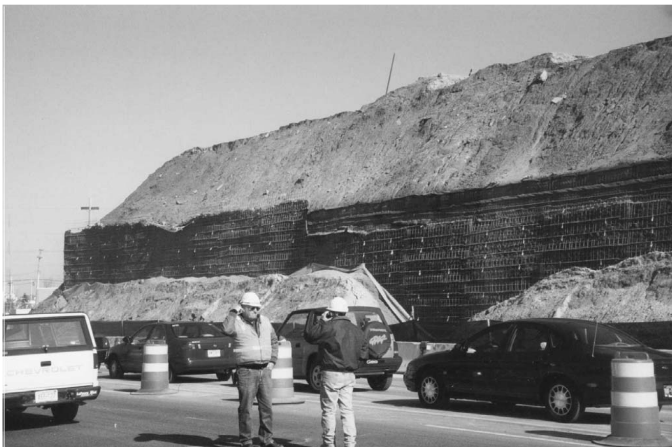
Figure 4. Temporary surcharge on wirewall, Atlantic City.

Over 4,000 square meters of the walls (8 bridge abutment locations and one approach ramp location) at this project were constructed using the two-stage wall system due to anticipated differential settlements being greater than 1% and due to unavailability of space for placement of