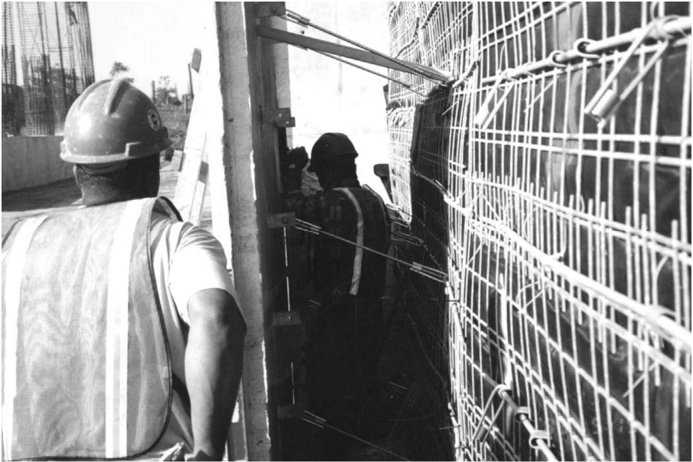
Figure 2. Connection of precast panels to wirewall.

The natural moisture content of the peat layer was found to be near its liquid limit, indicating normally consolidated material with very low shear strength. Total settlements ranging between 0.9 meters and 1.5 meters were estimated to occur due to the construction of the 10 meters high embankment.